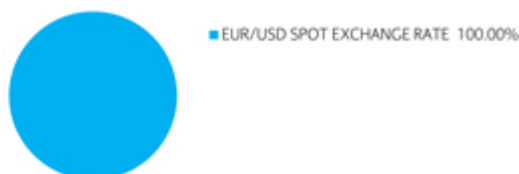
Index composition is subject to change.