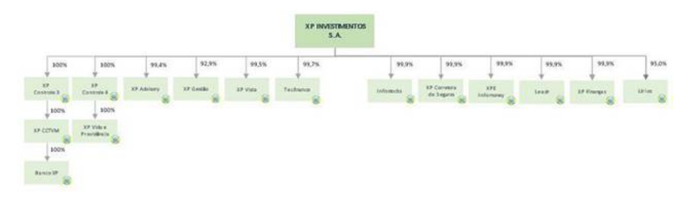
EXHIBIT A TO XP INC. SHAREHOLDERS' AGREEMENT