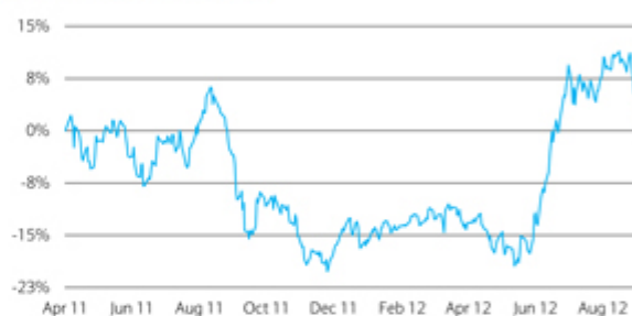
■ Barclays Commodity Index Agriculture Pure Beta TR