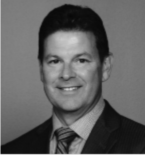
Director since: 2011 Independent