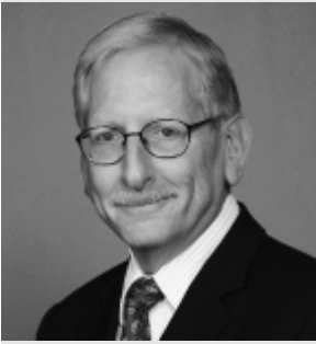
Director since: 2008 Independent