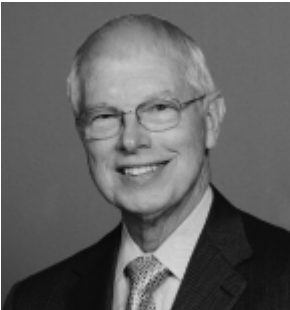
Director since: 2000 Independent