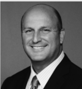
Director since: 2008 Management