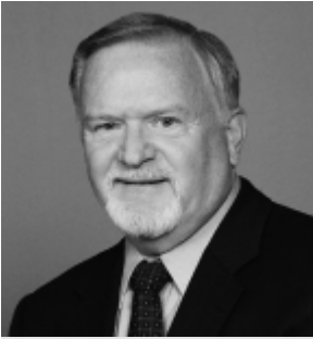
Director since: 2001 Independent

individuals who have served as chief executive officers and chief financial officers of such companies. The Nominating and Corporate Governance Committee and the Board of Directors consider the skill sets both individually and as a whole in considering who to recommend as nominees. The Board of Directors believes that all of the members of the Board have the highest professional and personal ethics and values.