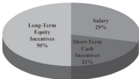
Chief Executive Officer / Chief Financial Officer Average (1)