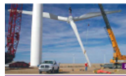
Other industry segments

Good progress continues to be made in the development of Shell's Gas to Liquids project in Qatar. This includes the signing of the Development and Production Sharing Agreement in July this year, the drilling of the first of two appraisal wells in February and the award of the onshore engineering and design contract in March.