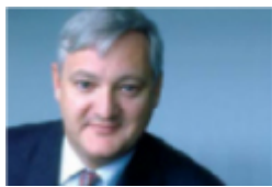
Peter Voser Appointed Group Director of Finance with effect from October 4, 2004.

P eter Voser will become the Group's Director of Finance from October 4, 2004. He will also be appointed a Managing Director of The "Shell" Transport and Trading Company, p.l.c. and a Group Managing Director of the Royal Dutch/Shell Group of Companies. At present he is the Chief Financial Officer and a member of the Group Executive Committee of the Asea Brown Boveri (ABB) Group of Companies, based in Switzerland. From 1982 to 2002 he worked for the