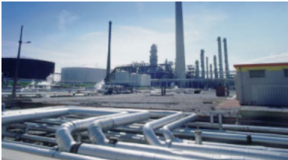
Stanlow Refinery in Cheshire, UK

There was some positive progress with the start of two major projects, Kashagan in Kazakhstan and Ormen Lange in Norway, and the start of production at the Coulomb, Glider and Llano fields in the Gulf of Mexico. However, the combined performance on production, costs, and reserves replacement has been disappointing. Production this year is expected to be some 3.7 to 3.8 million barrels of oil