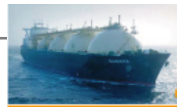
Gas & Power