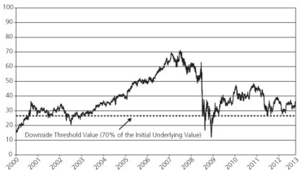
The Common Stock of MetLife, Inc. - Daily Closing Prices April 5, 2000 to January 18, 2013