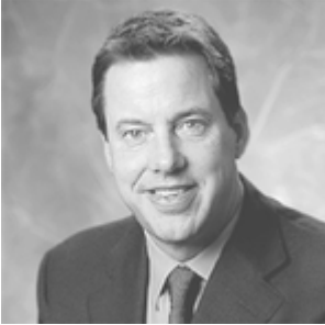
William Clay Ford, Jr.

Recent Business Experience: Mr. Ford has held a number of management positions within Ford, including Vice President – Commercial Truck Vehicle Center. From 1995 until October 30, 2001, Mr. Ford was Chair of the Finance Committee. Effective January 1, 1999, he was elected Chairman of the Board of Directors and effective October 30, 2001, he was elected Chief Executive Officer of the Company. Mr. Ford became Executive Chairman of the Company on September 1, 2006 and is the current Chair of the Finance Committee. Mr. Ford also is Vice Chairman of The Detroit Lions, Inc., Chairman of the Detroit Economic Club, and Trustee of The Henry Ford. He also is a member of the Boards of Business Leaders for Michigan and the Henry Ford Health System.