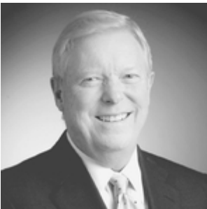
Richard A. Gephardt

Recent Business Experience: Mr. Gephardt has been President and Chief Executive Officer since 2005 of Gephardt Group, LLC, a multi-disciplined consulting firm. He also served as Strategic Advisor for the Government Affairs practice group of DLA Piper, one of the world's largest legal services providers, and as a consultant to Goldman, Sachs & Co. Mr. Gephardt is the former Majority Leader of the U.S. House of Representatives and served 14 terms in Congress from 1976 until January 2005. While in Congress, he served on the Budget Committee and on the Ways and Means Committee. Mr. Gephardt was elected Chairman of the House Democratic Caucus in 1984; and he served as majority leader from 1989 to 1994. In 1994, he was elected House Democratic Leader, the top Democratic leadership position in the House. Mr. Gephardt also served as minority leader from 1995 to 2003. Within the past five years, Mr. Gephardt served on the board of Dana Holding Corporation.