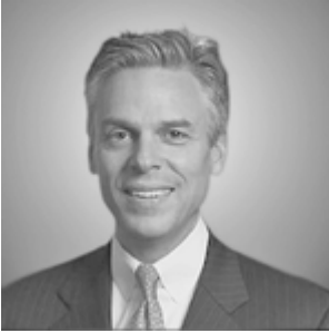
Jon M. Huntsman, Jr.

Principal Occupation: Chairman of the Huntsman Cancer Foundation, Salt Lake City, Utah