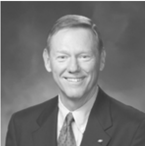
Alan Mulally Age: 67 Director Since: 2006

Recent Business Experience: Mr. Mulally was elected President and Chief Executive Officer of Ford effective September 1, 2006. Since March 2001, Mr. Mulally had been Executive Vice President of the Boeing Company and President and Chief Executive Officer of Boeing Commercial Airplanes. He also was a member of the Boeing Executive Council. Prior to that time, Mr. Mulally served as President of Boeing's space and defense business. Mr. Mulally has served as co-chair of the Washington Competitiveness Council, and has sat on the advisory boards of NASA, the University of Washington, the University of Kansas, the Massachusetts Institute of Technology, and the U.S. Air Force Scientific Advisory Board. He is a member of the U.S. National Academy of Engineering and a fellow of England's Royal Academy of Engineering.