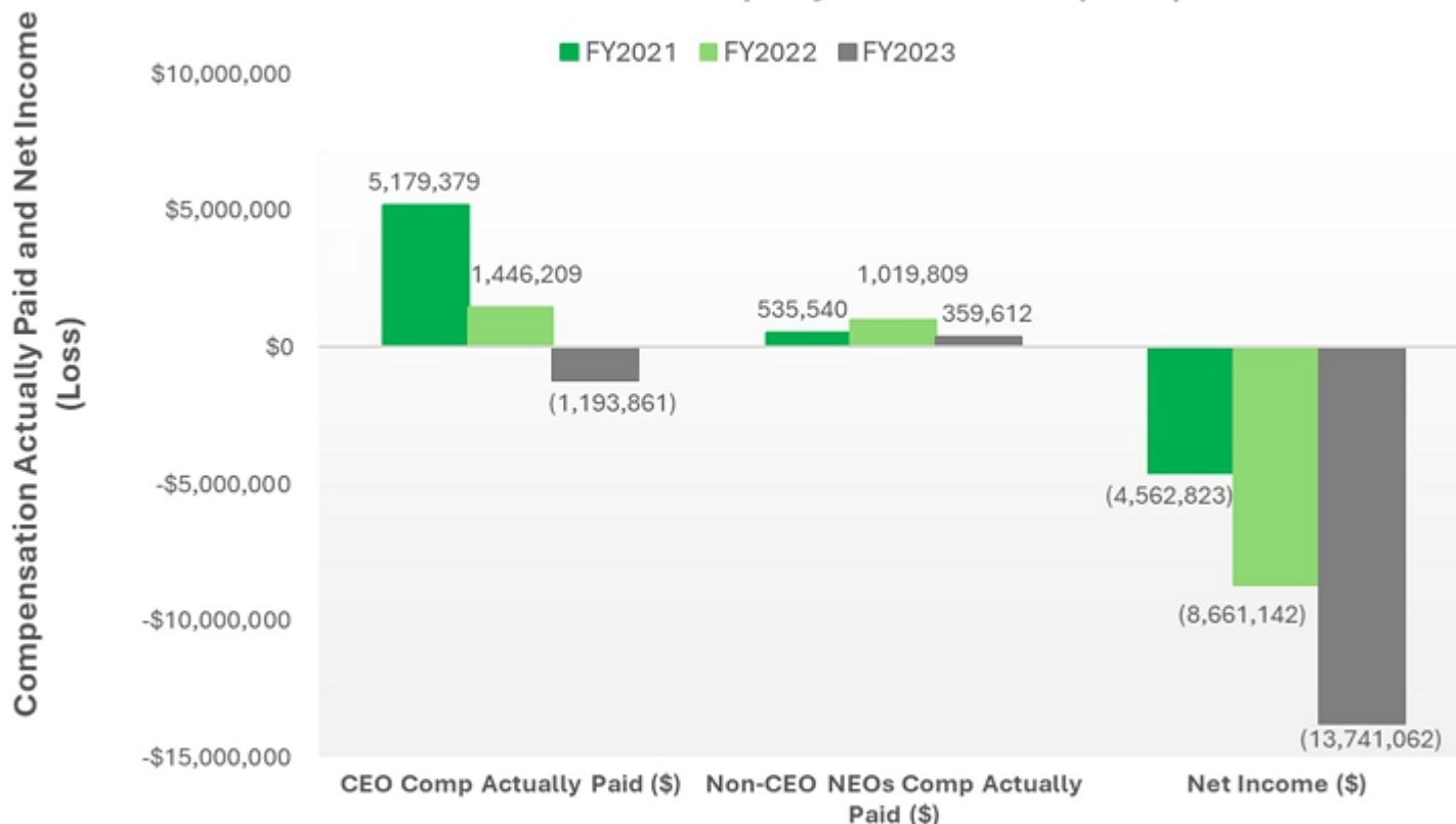
Relationship Between CEO,NEO Compensation Actually Paid and Company Net Income (Loss)

The following chart sets forth the relationship between Compensation Actually Paid to our CEO, the average of Compensation Actually Paid to our Non-CEO NEOs, and the Company’s Net Loss over the fiscal three year period from 2021 through 2023.